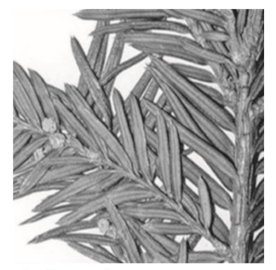
talis patra तालिस पत्ता